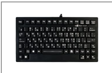
DS85S USB BL HL9