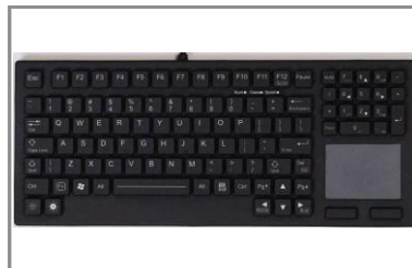
DS105S TP USB BL HL9